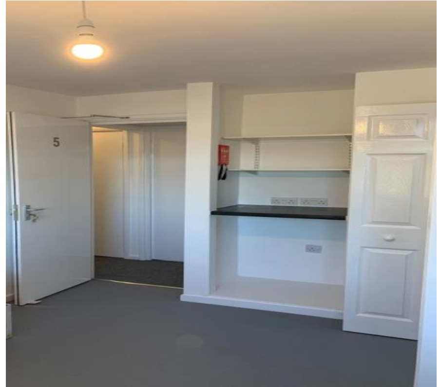
Private fridge and limited cooking