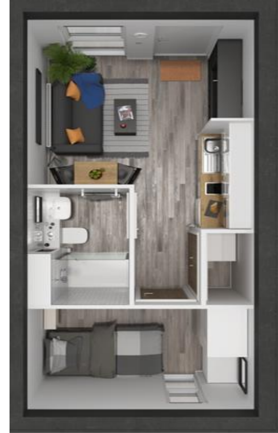
Self contained units